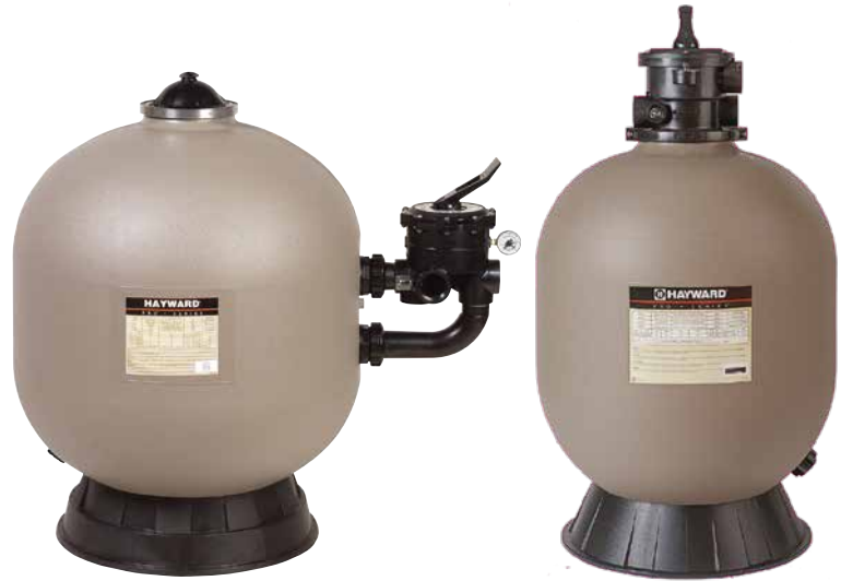
ProSeries™ HB Side