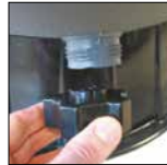
Drain with plug that also serves as a dismantling tool