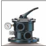
Sand easily accessible by removing the collar