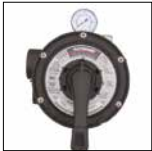
Vari-Flo™ 6-position valve