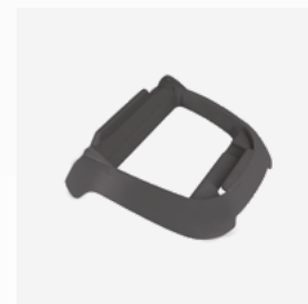
Base for the control unit