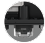
Built-in pH regulator