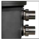
Standardised union fittings are supplied with our pumps