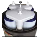
Top manifold configuration provides excellent filtration and hydraulic performance