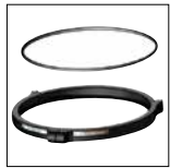
The Hayward® filter clamp assembly consists of two key components that work together with the clamp