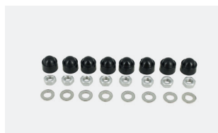
Bolts & caps kit