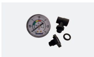
Pressure gauge & air relief valve kit