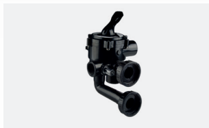
«Classic» multiport valve kit